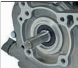
Albero cilindrico D.15 Cilindric - shaft